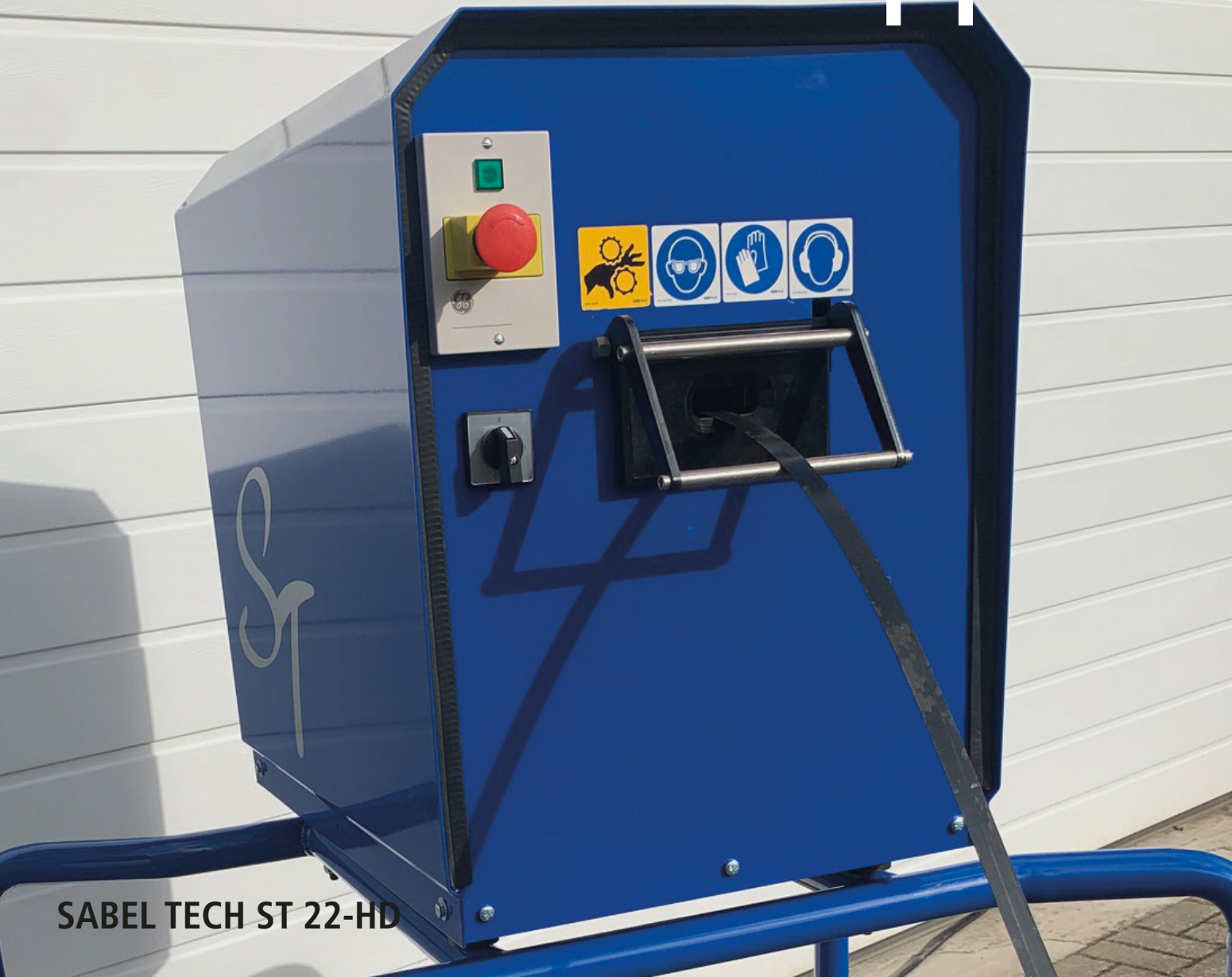
SABEL TECH ST 22-HD