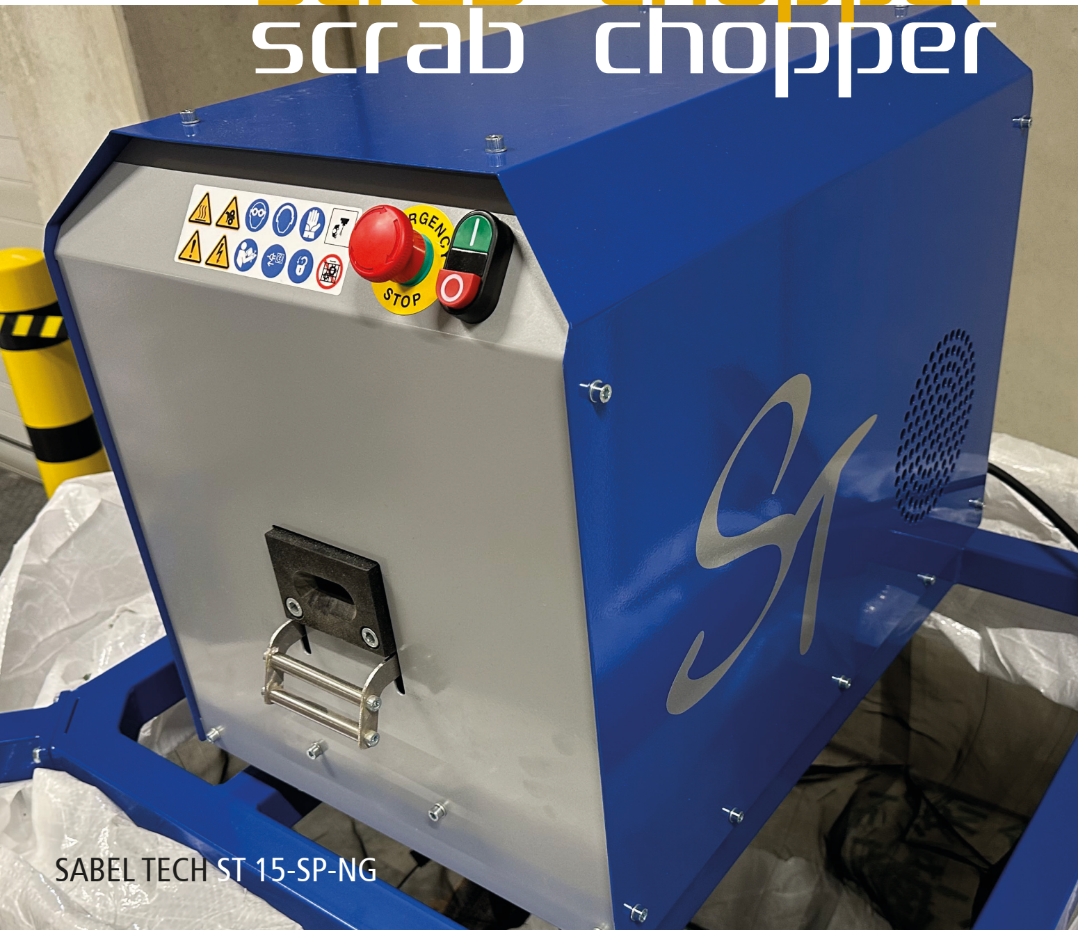
SABEL TECH ST 15-SP-NG